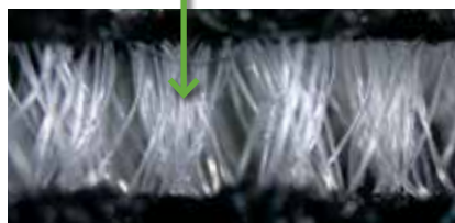
▲ Spacer fabric in cover.