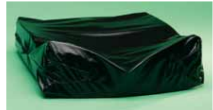
▲ Inner incontinent resistant cover, shown from the rear.

The cushion contour, spacer fabric outer cover and inner incontinent resistant cover all work together to keep the user and cushion dry. The inner cover really works. There are no seams or zippers in the path of liquid drainage, ensuring the cushion will not absorb moisture. Large accidents or spills simply pour off the back of the cushion.